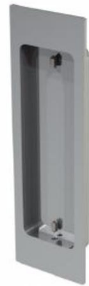
Concealed fixing method